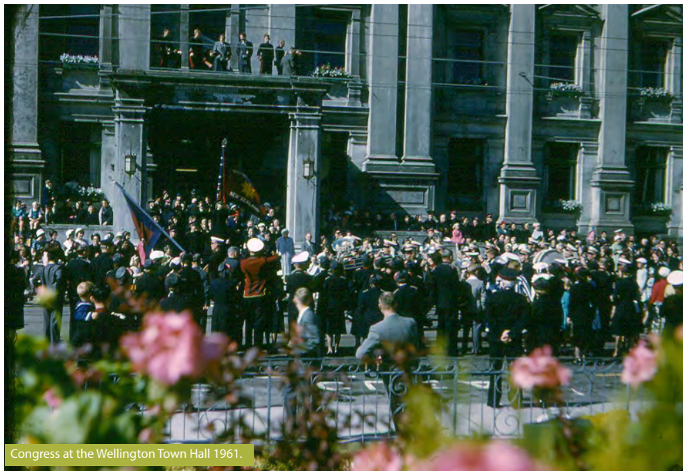
Congress at the Wellington Town Hall 1961.