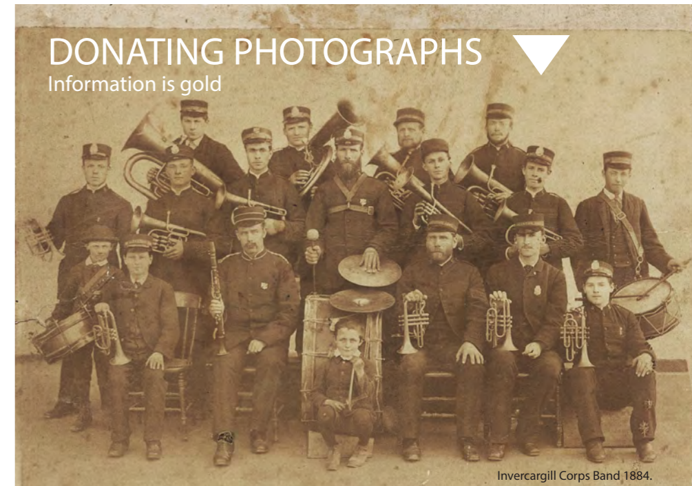
Invercargill Corps Band 1884.