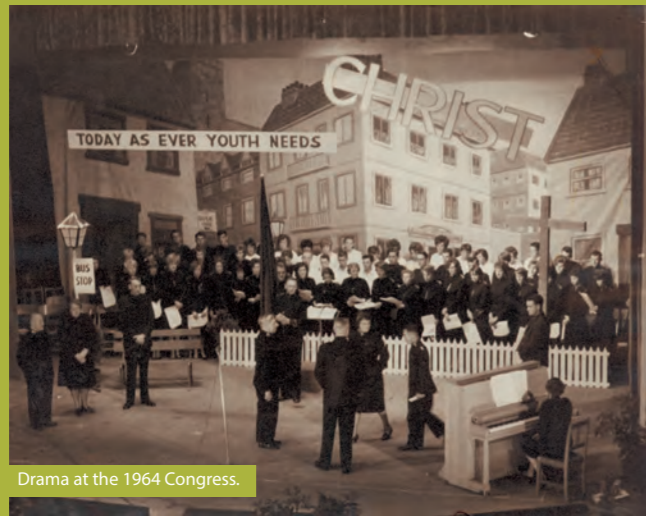
Drama at the 1964 Congress.

▶ The first Salvation Army Congress held in New Zealand occurred in Dunedin for a few days from Christmas Day 1883. The Salvationists assembled at Moray Place at 10am Christmas morning before a grand march around various streets of Dunedin. The photograph taken at the Congress (right) was taken on the Friday while events were held in and around the Caledonian Pavilion (Kensington). This was just the beginning of a tradition of congresses in New Zealand over the decades. And while there were congresses all around the world there were occasionally International congresses and many New Zealand Salvationists attended these. A feature of past congresses was the participation of many corps groups. Following are photographs from many of the New Zealand congresses.