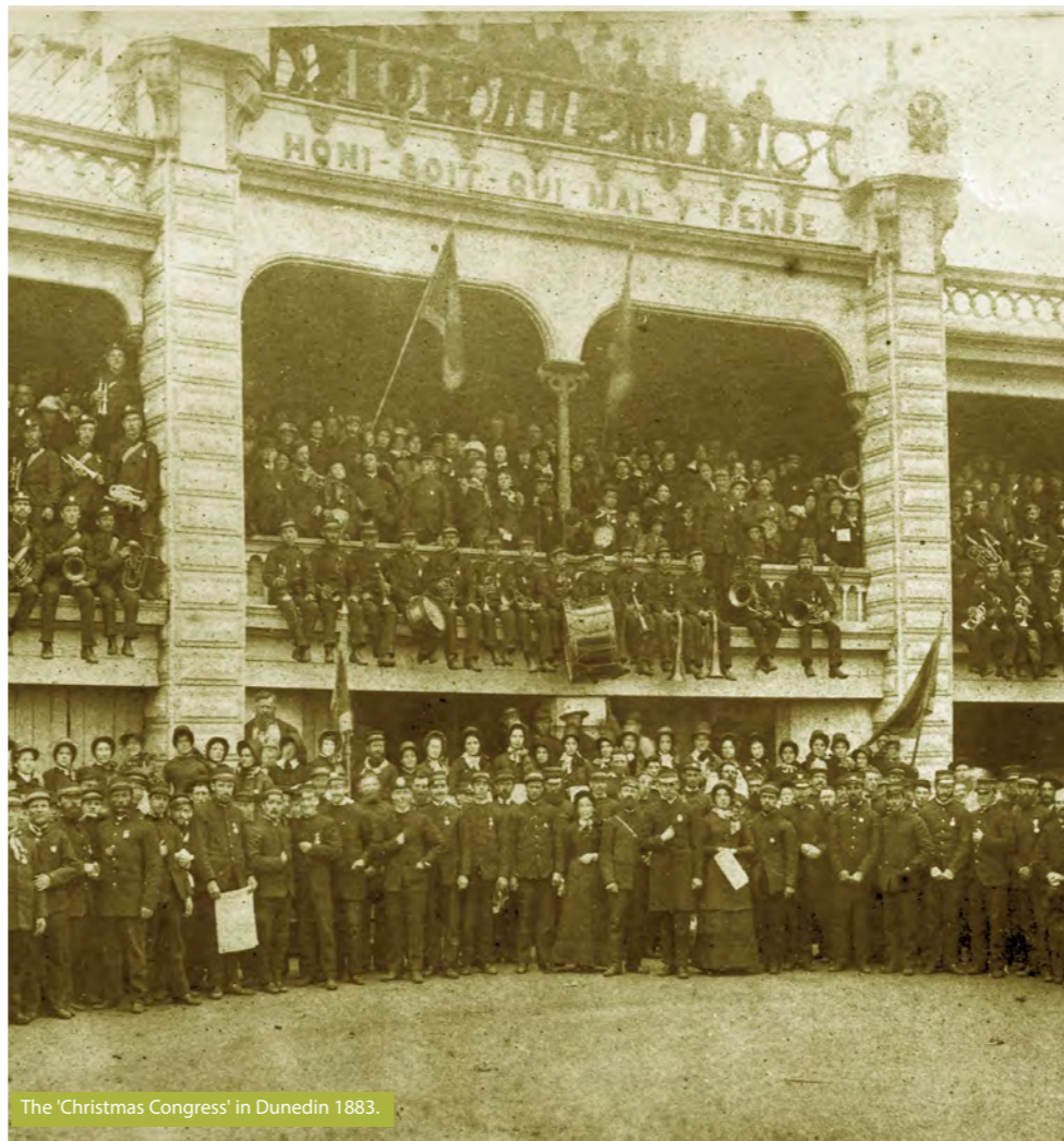
The 'Christmas Congress' in Dunedin 1883.