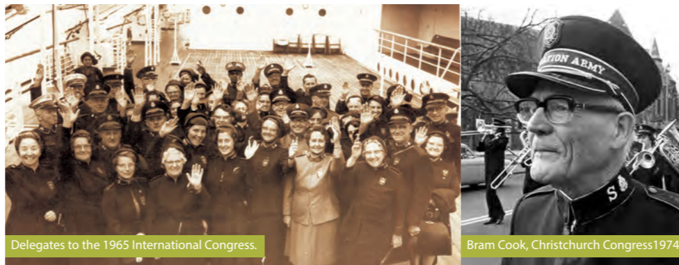
Delegates to the 1965 International Congress.