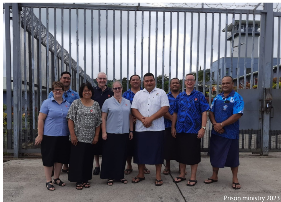
Prison ministry 2023

► Funded by Ministry of Foreign Affairs & Trade NZ from 2018 – Jan 2025, The Salvation Army Samoa Addiction Services developed from no services at all prior to June 2018 to include Faletalatala programme, one to one assessments and counselling services, Tutuga Taume Training programme (supporting Salvation Army staff and other government departments and NGO's with mental health and addictions training), Faleola O Tupu (House of Life & Growth), Tanumalala Prison Faletalatala programme, Education workshops for businesses, Mental Health awareness and Ending Violence Against Women and Girls (EVAWG) activities. ◀