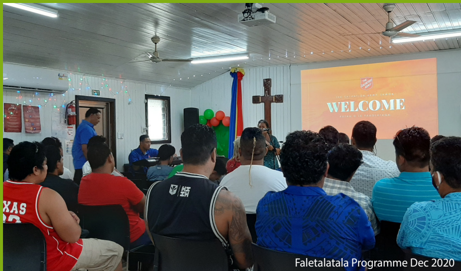
Faletalatala Programme Dec 2020

► Funded by Ministry of Foreign Affairs & Trade NZ from 2018 – Jan 2025, The Salvation Army Samoa Addiction Services developed from no services at all prior to June 2018 to include Faletalatala programme, one to one assessments and counselling services, Tutuga Taume Training programme (supporting Salvation Army staff and other government departments and NGO's with mental health and addictions training), Faleola O Tupu (House of Life & Growth), Tanumalala Prison Faletalatala programme, Education workshops for businesses, Mental Health awareness and Ending Violence Against Women and Girls (EVAWG) activities. ◀