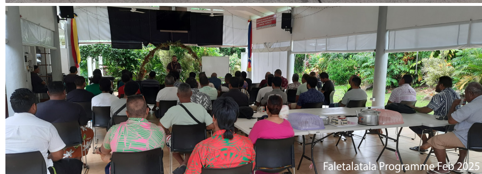
Faletalatala Programme Feb 2025