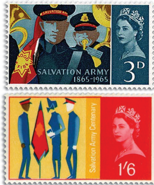
1965 Centenary Congress Stamps

Gregory Jennings | Territorial Archivist ◀