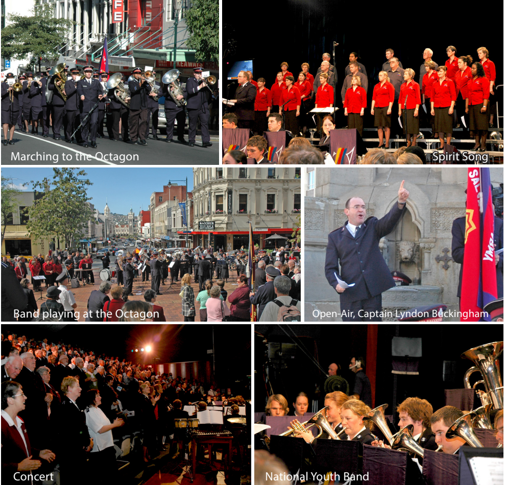
Marching to the Octagon