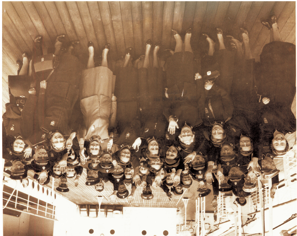
NZ & Australian Delegates on the deck of Orcades at Tilbury Dock, London

▶ Two World Wars had come and gone, their after-effects lingering after fighting ceased. At last the time was right for another International Congress. Though greeted warmly by previous monarchs, Salvationists were honored for the first time at the opening meeting by the presence of Queen Elizabeth II. Representatives of 25 countries made a ceremonial entry into Westminster Abbey